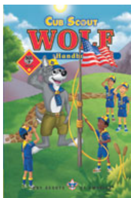
Wolf Handbook 2 nd Grade