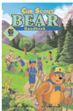
Bear Handbook 3 rd Grade